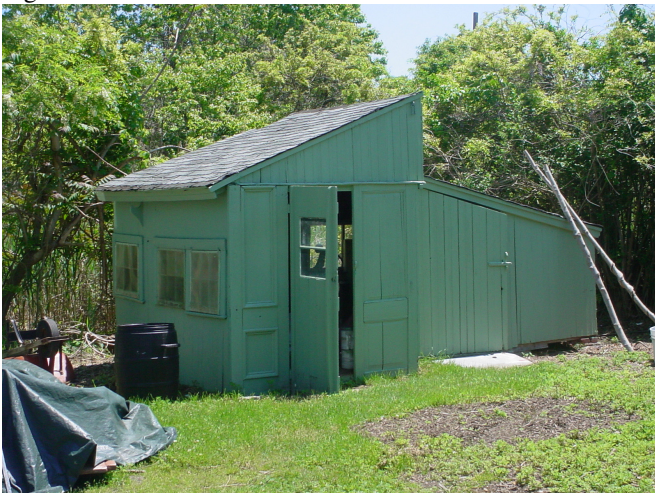
Figure 3 – Outbuilding in rear (east) lot, northwest elevation