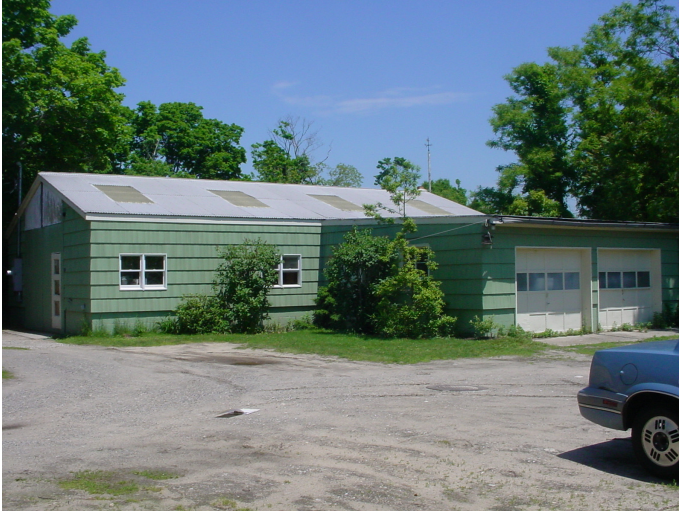
Figure 4 – Outbuilding in rear (east) lot, southwest elevation