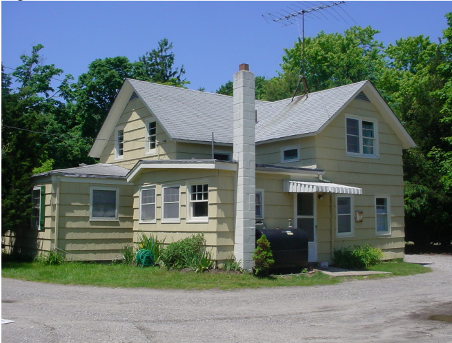
Figure 2 – Southeast elevation