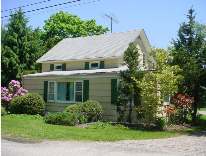
Figure 1 – Southwest elevation