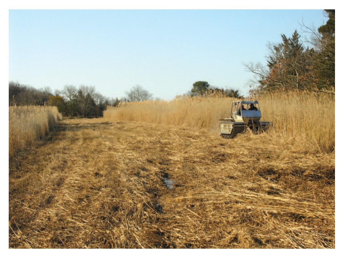
"Marsh Master II" mowing Phragmites along Beaver Dam Creek

The Foundation hopes to develop some walking trails along the bank of the Creek which has been opened up through this mitigation project.