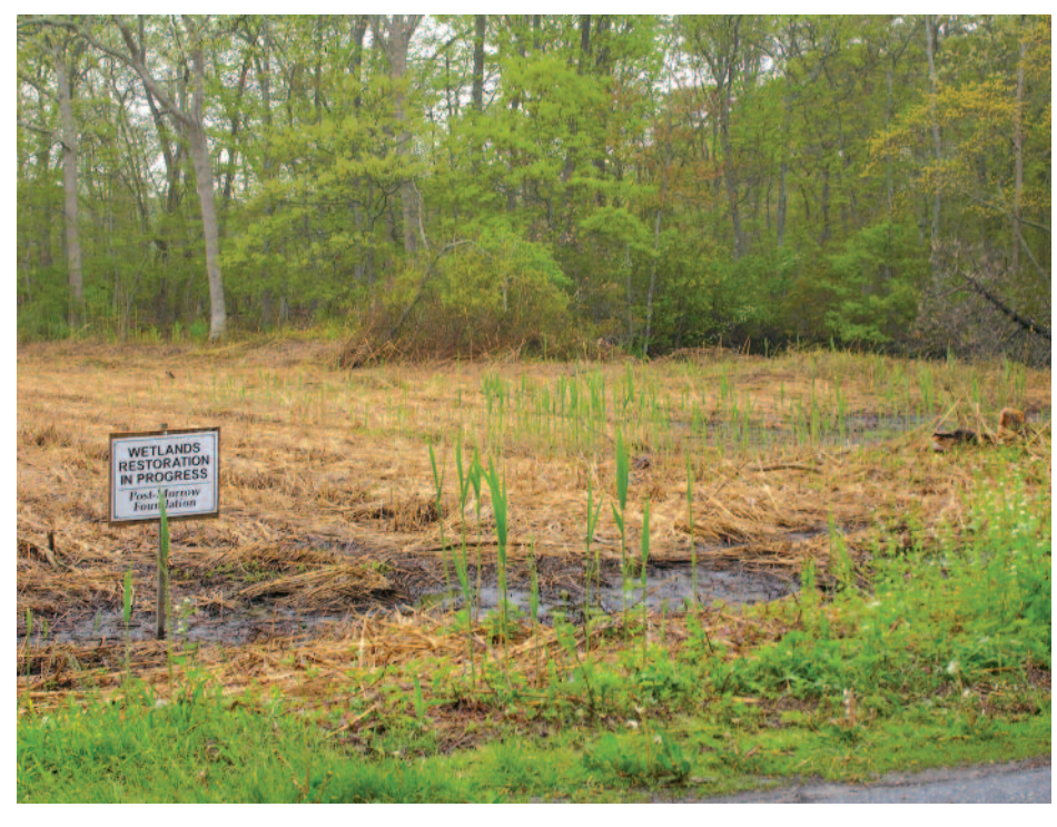
Wetland area along Bay Road. The sign indicates that the area is part of the Post-Morrow wetland restoration project. To the right is "Black's Pond".

mower deck. The Foundation has worked closely with