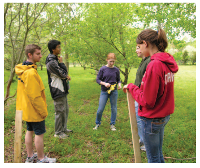
SEQ students placing markers for proposed path at Edgar Avenue