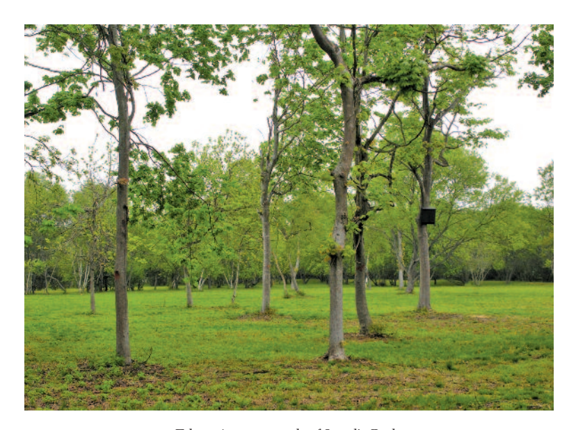
Edgar Avenue south of Jared's Path

The Foundation held a community meeting last year to present proposed plans for our nine acre property along Edgar Avenue. After incorporating this feedback into an updated plan, the Foundation has removed the invasive Wisteria vines and re-seeded the property to create more open spaces. Currently we are developing a trail system around the property with the