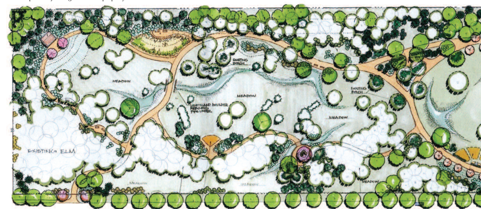
Concept Plan for Edgar Avenue property

The Concept Plan developed by Landscape Architect Kyo Matsumoto shown here, incorporates local input with the Foundation's vision for an open walking path in a naturalistic, park-like setting.