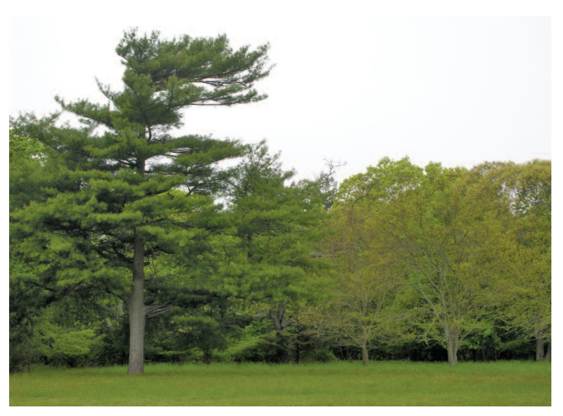
Above is pictured an Eastern white pine, one of many beautiful trees on the Marist property. It is anticipated that there will be trails on the property open to the public.